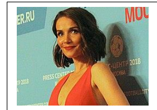
3- NATALIA OREIRO